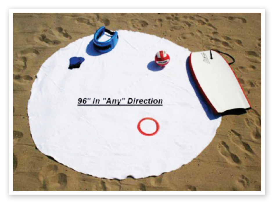
Sundial towel example from www.mysizeusa.com